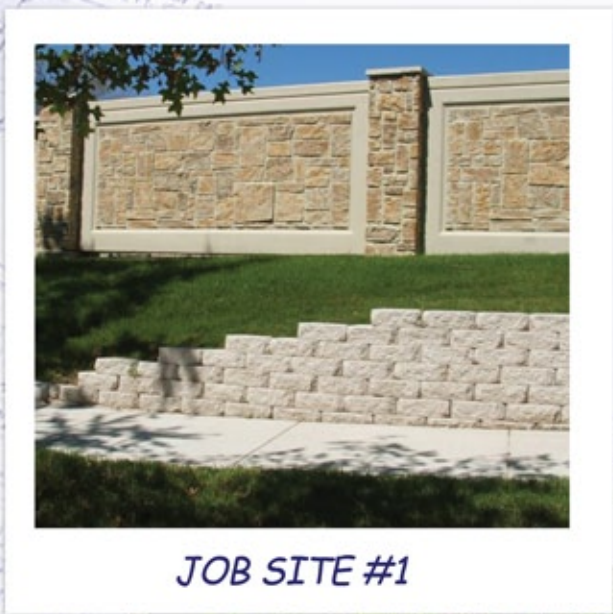
JOB SITE #1