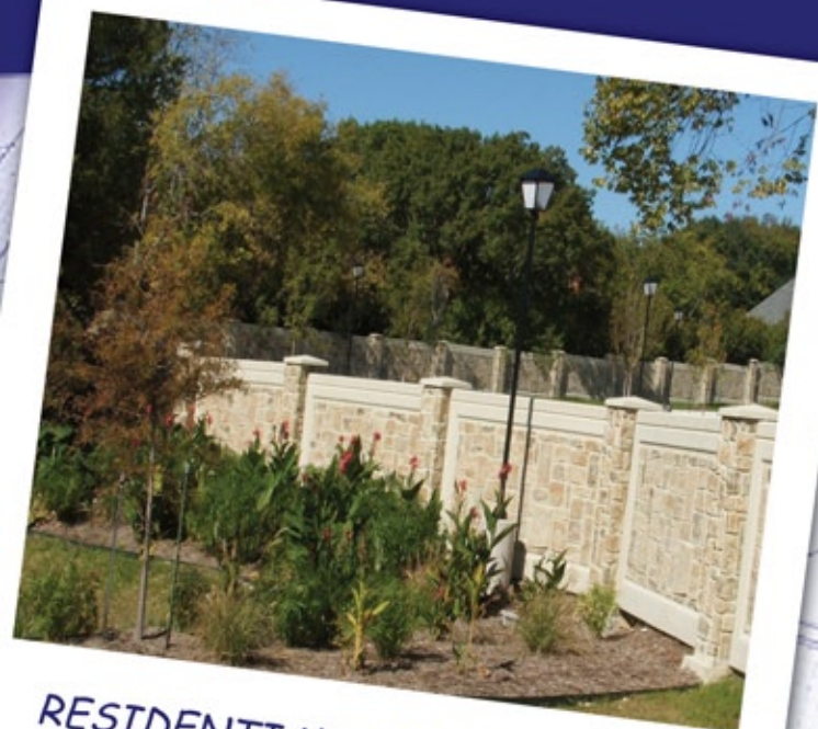
RESIDENTIAL SCREEN WALL