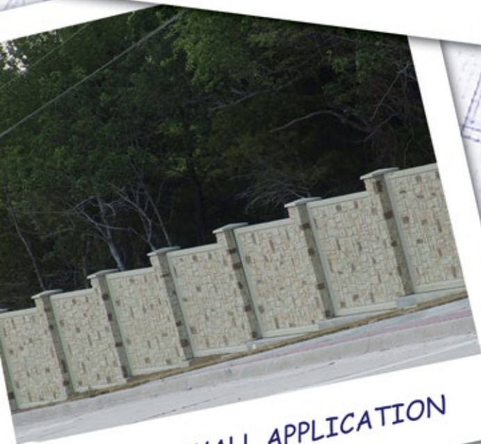
SOUND WALL APPLICATION