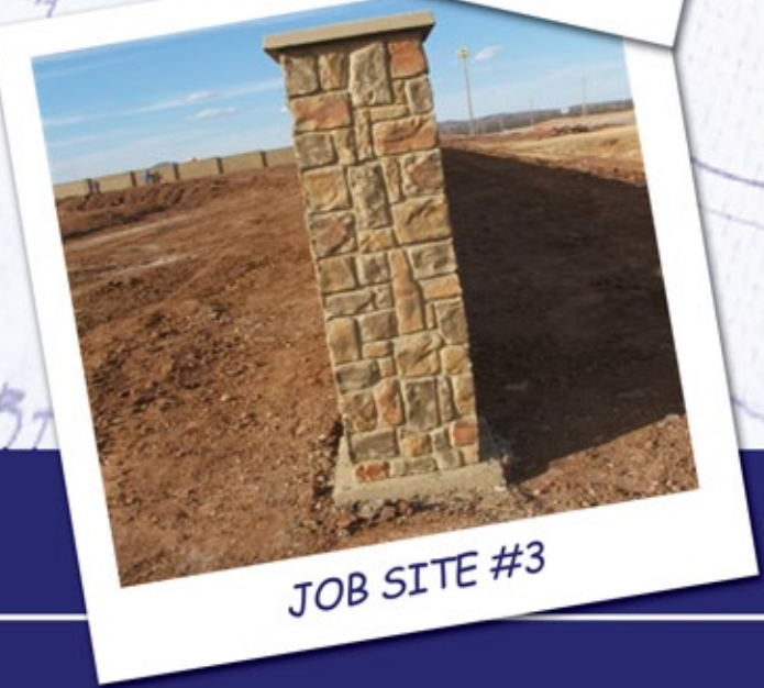
JOB SITE #3