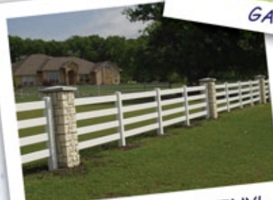
COLUMNS WITH VINYL