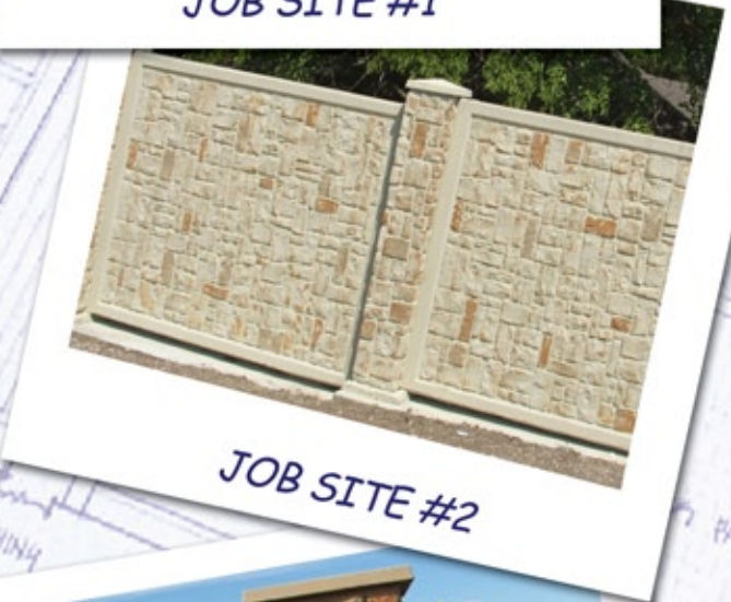
JOB SITE #2